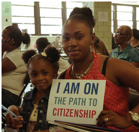
A participant on path to citizenship at one of our application assistance events.

In 1997, the City University of New York (CUNY) established CUNY Citizenship Now! to address the growing need for free citizenship and immigration services among CUNY's foreign-born students, faculty, and staff. We quickly expanded to serve all immigrant New Yorkers. We now operate six immigration centers recognized by the Board of Immigration Appeals (BIA) and one part-time center, providing a broad range of immigration law services. We also provide services in the offices of 30 New York City Council Members thanks to funding provided by the New York City Council.