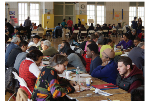
Corps volunteers and CUNY Citizenship Now! staff assisting participants at one of our many application assistance events held throughout New York City.

We collaborate with United States Citizenship and Immigration Services (USCIS) to make CUNY campuses available for citizenship swearing-in ceremonies.